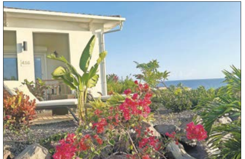
Above: The author dives into the turquoise sea. Below left: There is no better place to lounge than on your own private lanai. Below right: The multiple pools at Golden Rock offer stunning views of the island.

So, book that flight now — a secret paradise awaits.